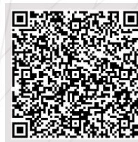
SIGNAGE PRODUCTS BROCHURE