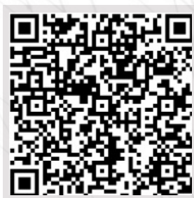
LED PRODUCTS CATALOGUE